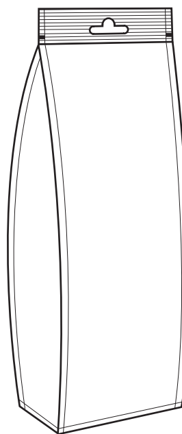
POUCH WITH HANG SELL HOLE