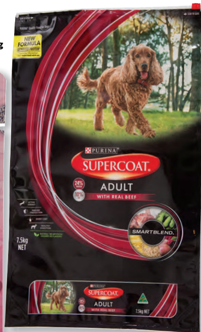
Supercoat Adult with Real Beef 7.5kg