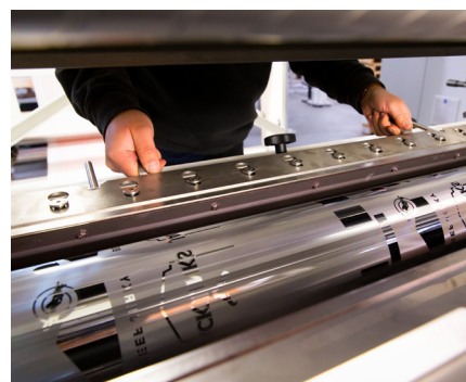
Convex can now be even more creative thanks to this downstream gravure unit on the new press.

The new press can accommodate 1000 diameter rolls and has an automatic turbo